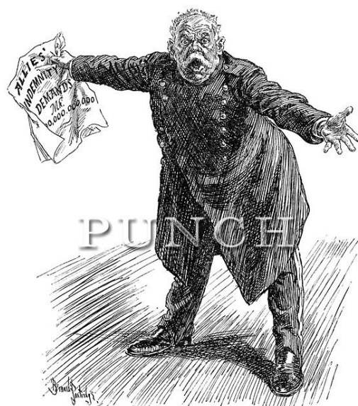
THE RECKONING. PAN-GERMAN. "MONSTROUS, I CALL IT. WHY, IT'S FULLY A QUARTER OF WHAT WE SHOULD HAVE MADE THEM PAY, IF WE'D WON."

Source D is criticising Germany. How do you know? (4 marks)