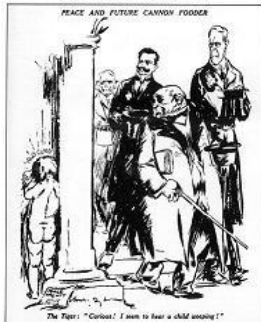
Source 18 A cartoon from the Daily Herald 1919

How useful are source 17 and 18 to a historian studying the reactions of the Treaty of Versailles? (12 marks)