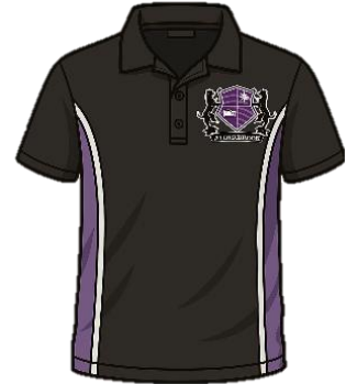
ABK PE Top